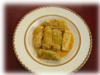
Sarma Serbian Cabbage Rolls

Pennwood staff can assist clients to prepare or cook ethnic specific meals of their choice in their home, if requested. Our clients can also choose to visit our facility at Pennington to join us for our multicultural lunch menu, activities and other celebrations or just to spend some time making new friends or catching up with old friends.