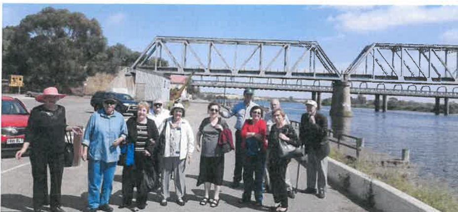
Bus Trip to Murray Bridge—6th December 2016