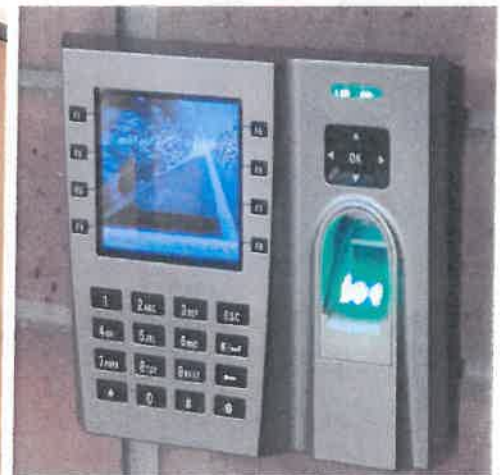
Clock In & Clock Out