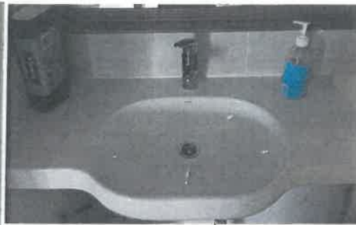
New opal sinks in all rooms