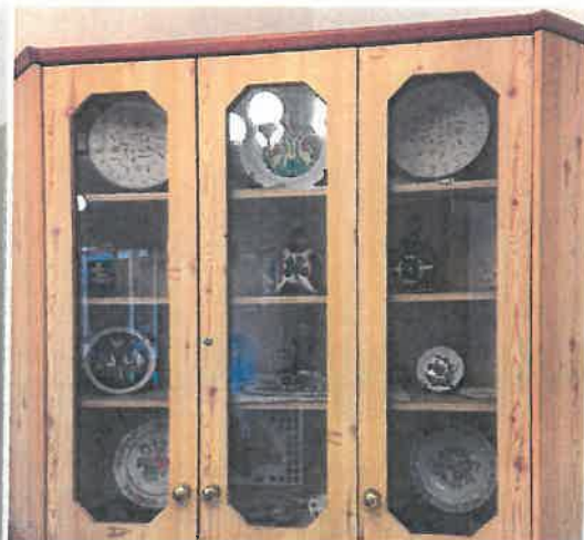
Show & Tell Multicultural Display Cupboards