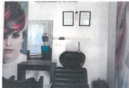
Jazzy new Hairdresser