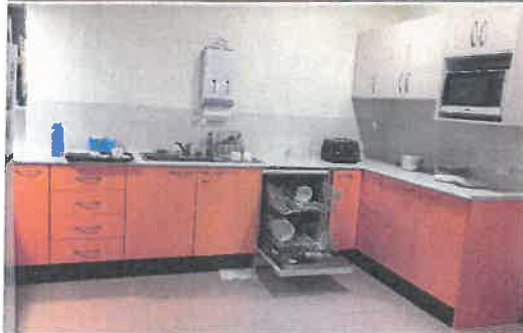
New Kitchen in Houses 1, 2 and also completed in House 3 & 4.