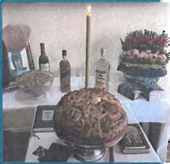
Slava Day 14th Nov 2016 St. Cosmas & Damian